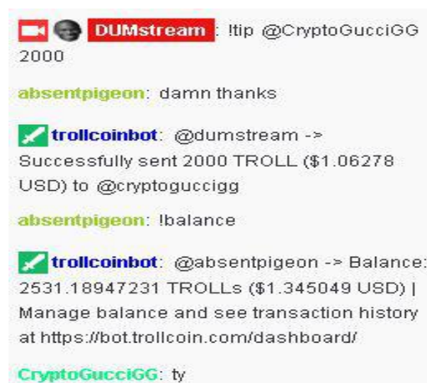
Figure 1. Tipping and Balance Functions

Trollcoin is the ultimate donation medium on Twitch with its colourful communities entrenched in $Troll culture. Twitch was the inspiration and remains a driving force of Trollcoin's continued development. Functions of the Twitch Trollcoinbot include: a !tip function: that allows a user to send Trollcoin to any Twitch user and the !balance function which displays a user's Trollcoin balance. Both functions display the corresponding USD value as shown in figure 1.