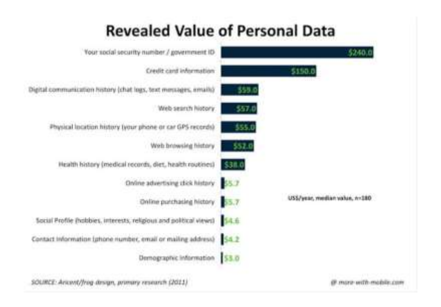
Figure 2. Value of a Personal Profile

User engagement through genuine feedback mechanisms ensures that consumers that have opted in for PUT are getting the best possible product match, that which they are most likely to convert into a transaction. Ultimately it comes down to trust and respect with and for the user. By keeping the data within a Blockchain, encrypting the data and shielding the identities of our consumers, PUT enables the Robin8 Platform to form a bond with consumers which proves that not only does their personal data hold value, this value is a substantial one which has been ignored and/or exploited by the middlemen in the current industry model (see Figure 2).