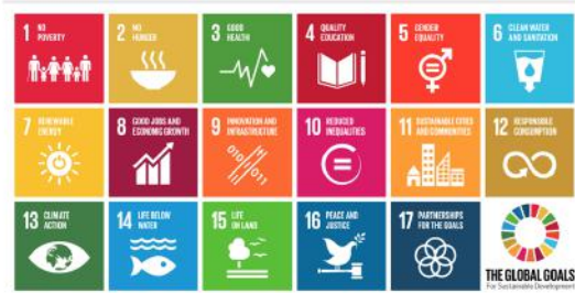
The UN's Global Goals for ending poverty, protecting the planet, and ensuring prosperity for all.

By aligning MOEDA model of incentives with the United Nations 17 Sustainable Development Goals(SDGs) we aim to create a shared, world-wide, cooperative effort where everyone is invited, has a role, and participates. The SDGs are a set of high-level goals, each grounded in a series of underlying performance indicators designed for integration and participation at every level of society and industry across the globe. Where the Millennium Development Goals largely failed to engage the world (because they were pointed at governments, not people) the Sustainable Development Goals have been translated into performance guides for businesses, curricula for schools, games, activities, workshops, and on and on. They were designed with a diverse set of on-ramps, to be a common language and measurement system for everyone.