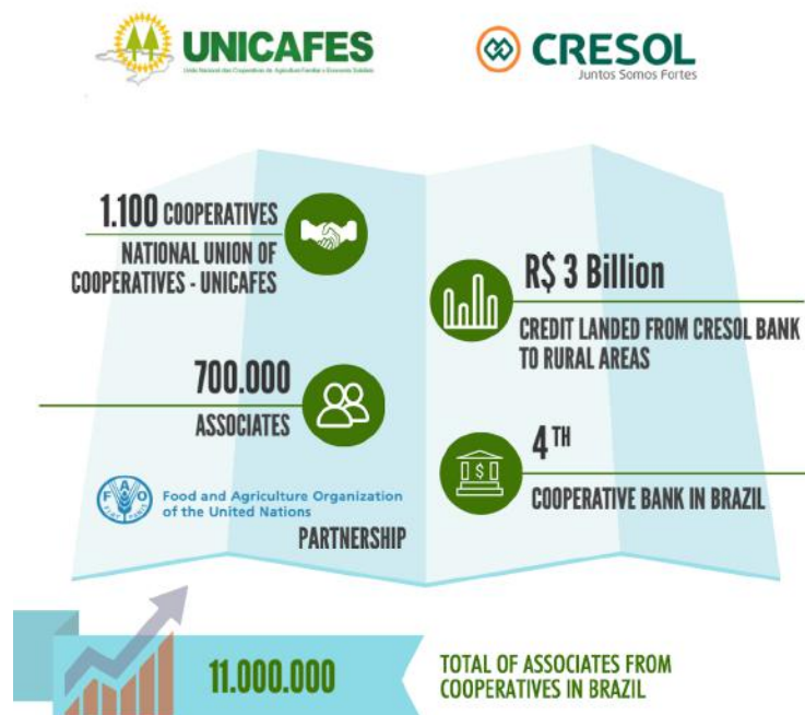
Figure 1: MOEDA Partners

MOEDA partners, the cooperative entities UNICAFES and CRESOL have combined 700.000 associates in more than 1.100 cooperatives and are for 30 years providing micro-loans and financial services for small agriculture families in Brazil. Under UNICAFES umbrella MOEDA is directly working with 170 Brazilian Cooperative Credit Banks and 128 Communitarian Banks to give mobile banking and access to capital for sustainable development projects. During the first year, MOEDA Seed Projects Program aims to contemplate 100.000 associates, with preference for woman, to receive MOEDA's first lines of credit.