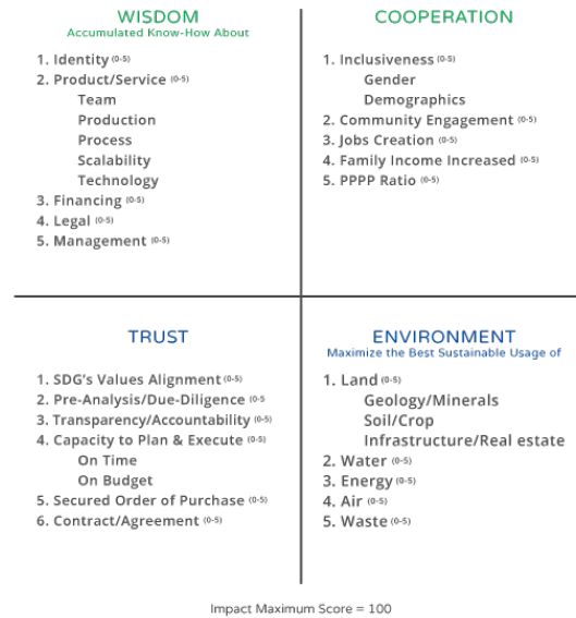
Figure 2: MOEDA Integral Equilibrium Impact Formula

rampant, most of information still resides in either paper records or in outdated proprietary data bases, blockchain-enabled registries are a reliable alternative to current registries.