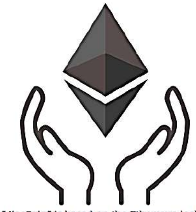
The "IjasCoin" is based on the Ethereum lockchain protocol. Therefore, it is safe, cost-efficient and fast. Furthermore, it allows to use smart contracts within its protocol.

Check Out IjasCoin Token in Ethereum Blockchain