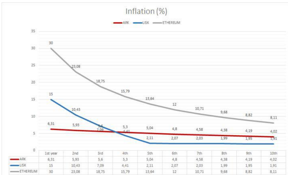
Inflation rate over time (Ethereum and Lisk for comparison)